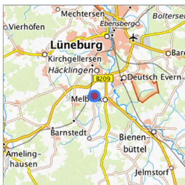
Location in the requested region