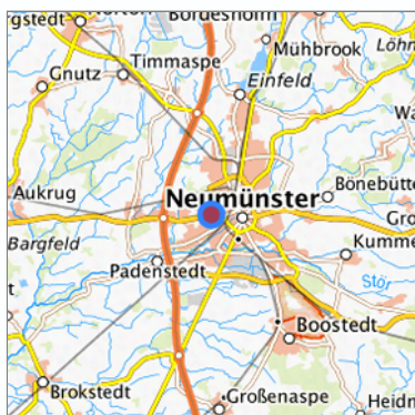
Location in the requested region