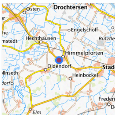
Location in the requested region