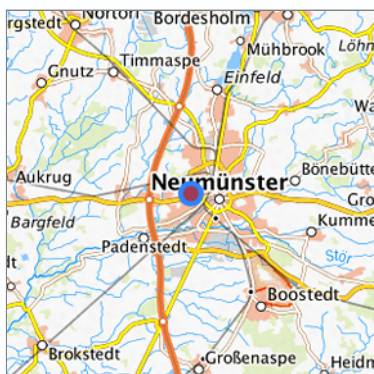
Location in the requested region