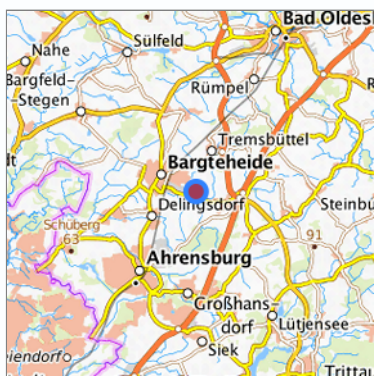
Location in the requested region