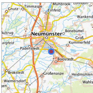
Location in the requested region