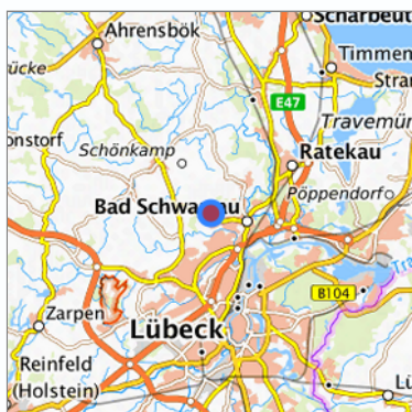
Location in the requested region