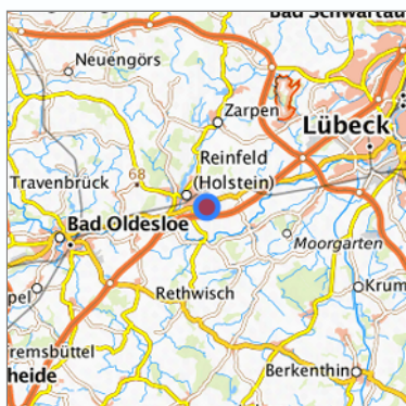
Location in the requested region