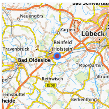
Location in the requested region