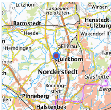
Location in the requested region