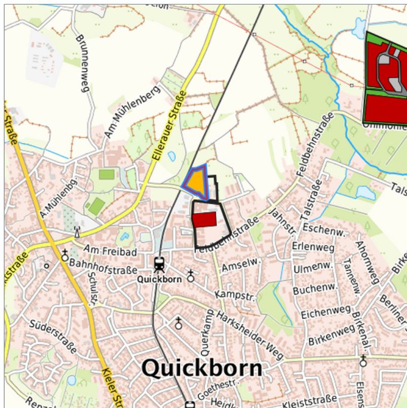
Detailed view of the requested site